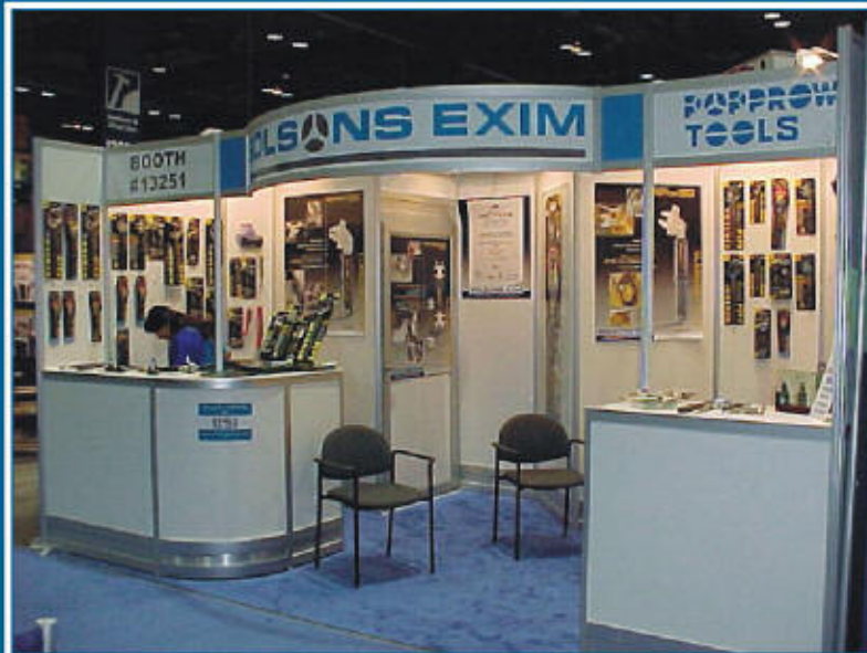
HARDWARE SHOW, CHICAGO, USA