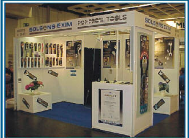
INTERNATIONAL HARDWARE FAIR, KÖLN, GERMANY